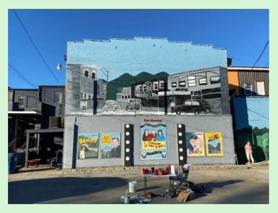
The back of the Sipp Theatre in downtown Paintsville has a whole new look celebrating it's early days of the movie theatre.